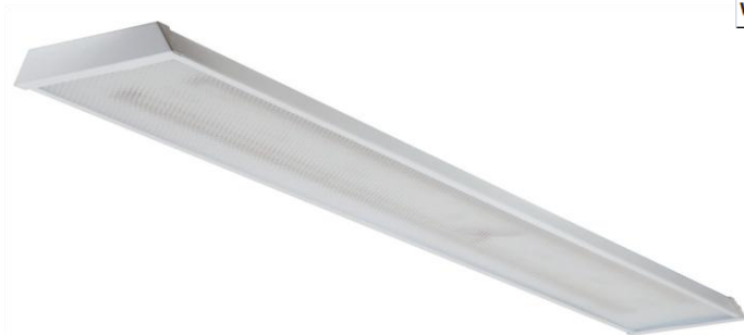
24VDC Indoor Flat Pack LED Light